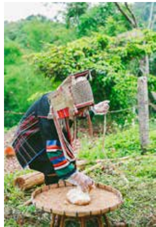
https://readthecloud.co/doi-phamee/ (Illustration only, not the actual victim.)

Participants reflected that this woman’s story deeply impacted them, helping them recognize human trafficking as a close and tangible threat that can occur to anyone at any time.