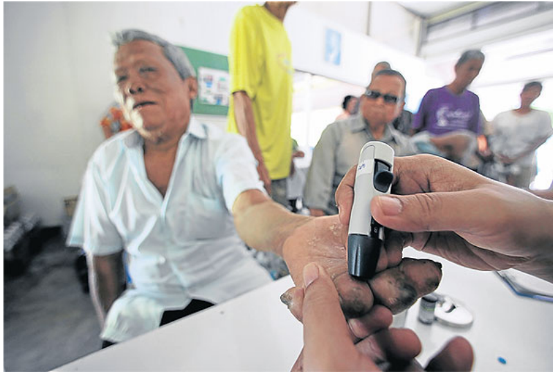
A large number of lepers are diagnosed with diabetes, so healthcare practitioners provide them with regular medical examination to check their blood sugar levels.